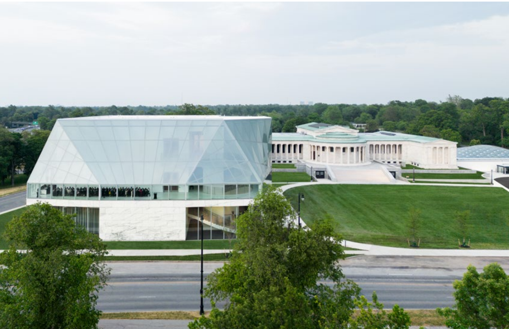
The Buffalo AKG Art Museum campus looking east along Elmwood Avenue.

The Board of Directors extends deep gratitude to each of the generous donors who have made gifts and pledges to the campaign. Gifts of $1,000 or more are listed here.