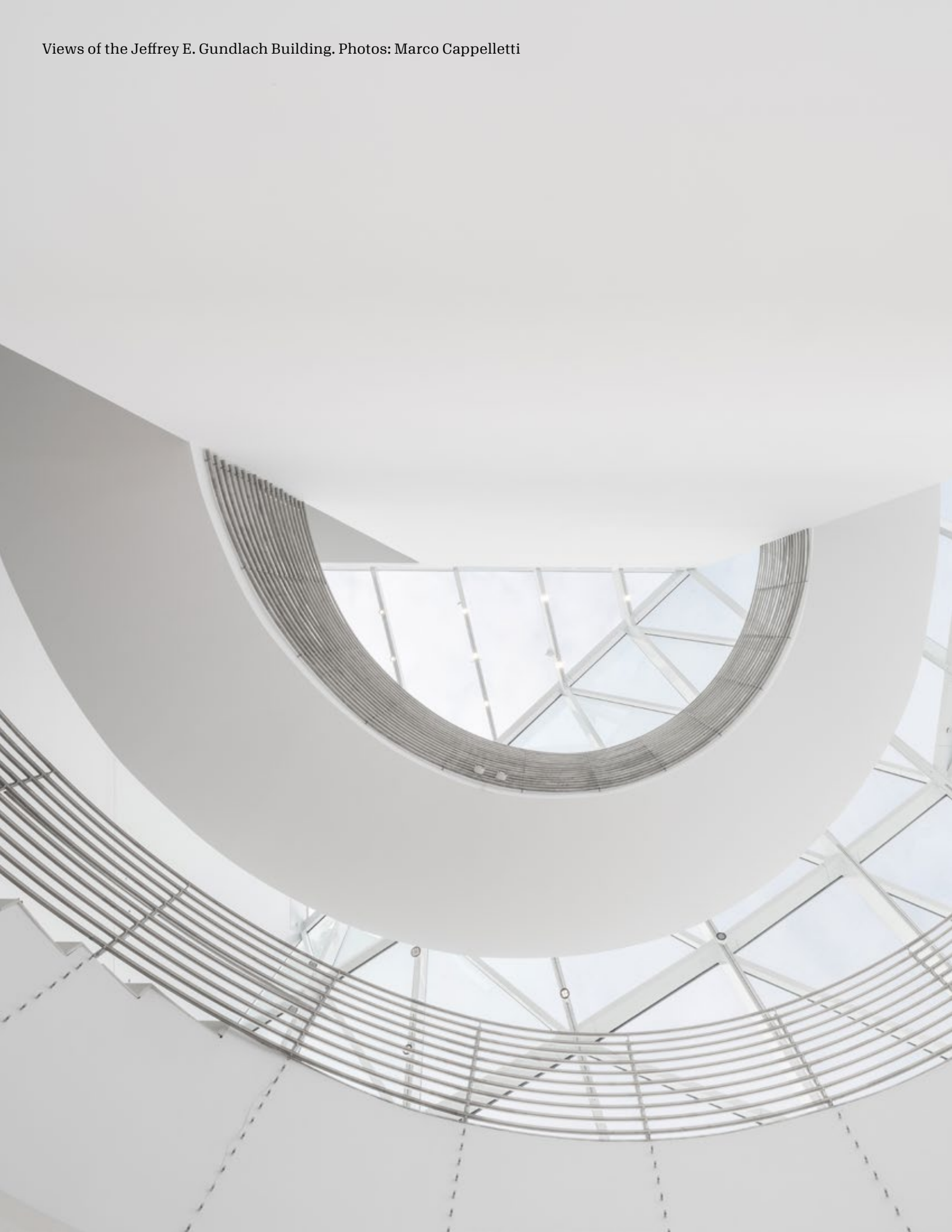
Views of the Jeffrey E. Gundlach Building.